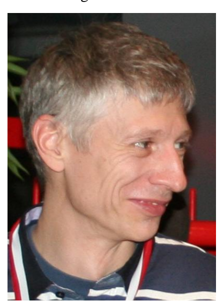
matter, when friends understand each other, even with difficulty

But let's not about the sad, especially because already it's time the most interesting event (except the races, of course!), awards ceremony. This is a magical time, a very brief moment when all the skaters feel the members of large families, when the age difference does not